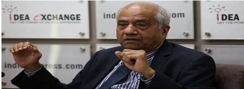
Former Supreme Court Judge Justice B N Srikrishna at Idea Exchange

Written by Apurva Vishwanath | New Delhi | Updated: May 13, 2020 11:37:10 am