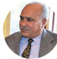
Justice Husnain Masoodi (Hon'ble Member of Lok Sabha Former Judge High Court