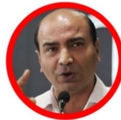
Shri Ashwani Upadhyay Advocate Supreme Court PIL Man of India BJP Spokesperson

For free Registration Contact +919643442231