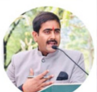
Shree Ashwini Dubey (Advocate on record Supreme Court, Media Penalist