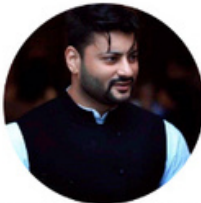
Mr. Anubhav Mohanty Member of Parliament Youth icon